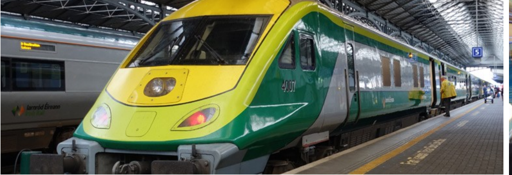
A Dublin to Cork express train boarding at Heuston station