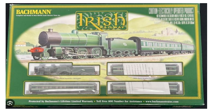
Bachman Irish Train Set