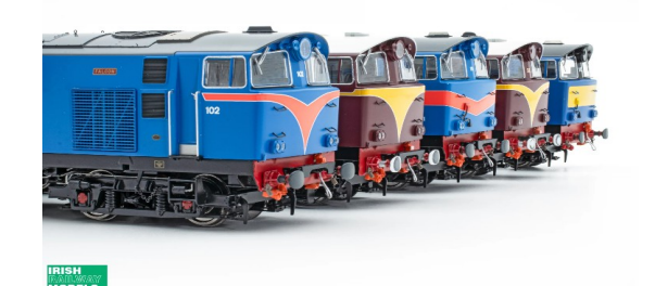
From Irish Railway Models - NIR 101 / DL Class - Hunslet