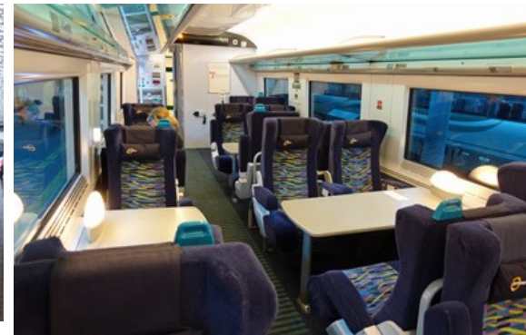
First class seats, 1+2 across car width.